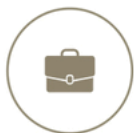
FOUNDER AND CHAIRMAN, SOBHA GROUP