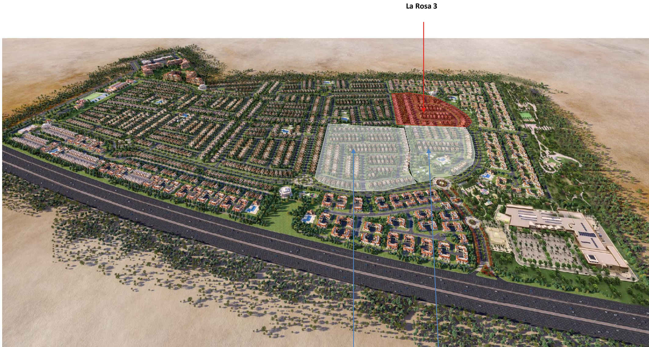
La Rosa 3